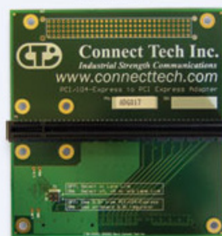
For use with top stacking CPUs