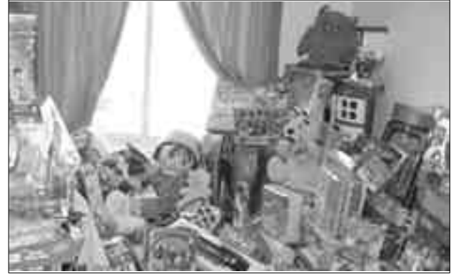
Too many toys to count! Toys donated by Home Hardware are sorted and distributed for the benefit of the children of kidsLINK.

Home Hardware's creative approach to assisting kidsLINK is a welcome donation year after year. Since the launch of the first 'We Believe in Kids' campaign in 1997, Home Hardware has been a great community partner for the Foundation. ■